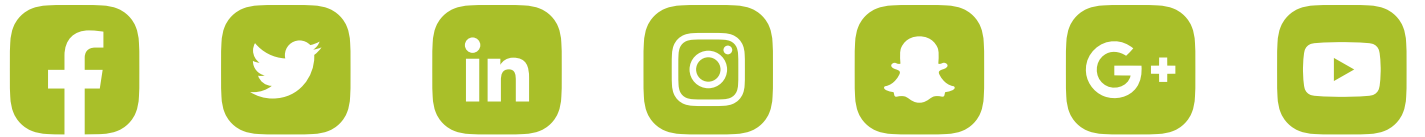
Michigan Farm Bureau (on light backgrounds)