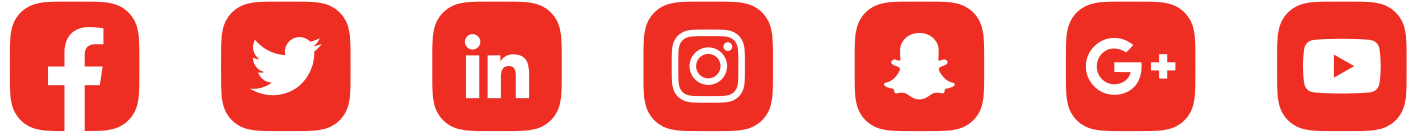
Farm Bureau Insurance (on light backgrounds)