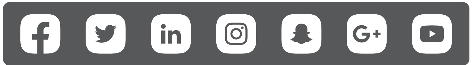
All Companies (on dark backgrounds)