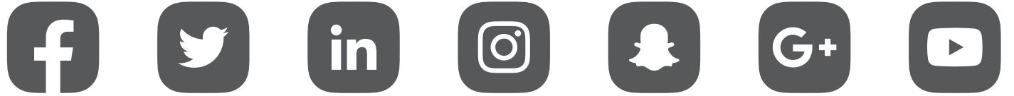
Michigan Farm Bureau Family of Companies (on light backgrounds)

For consistency purposes across our materials and websites, we use our own social icons which places them inside a rounded corner square. This allows us to keep sizing and spacing similar with easy color changes to represent each brands social sites.